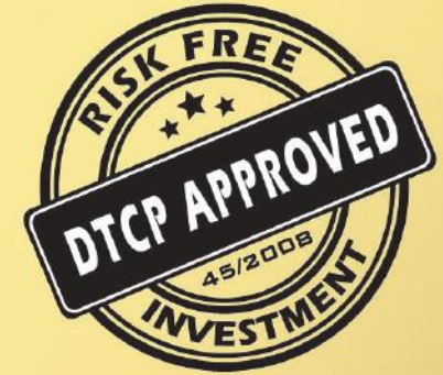
Approved Layout of House Sites in S.No : 444/1B1 & 1B2 Of V.No : 101 Adayalacherry Village (parameshwara mangalam), cheyyur Taluk, Kancheepuram District